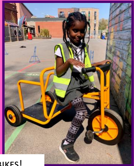
RECEPTION ENJOYING SUNSHINE AND NEW BIKES!