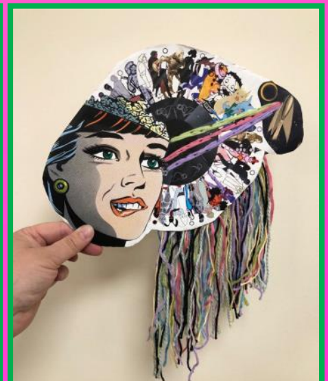
COLOURFUL CREATIONS FROM THE PARENTS CRAFT AND CHAT SESSIONS (ON THURSDAYS!)