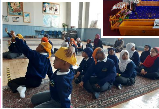
YEAR 2 ENJOYED A TRIP TO THE GURDWARA TEMPLE!