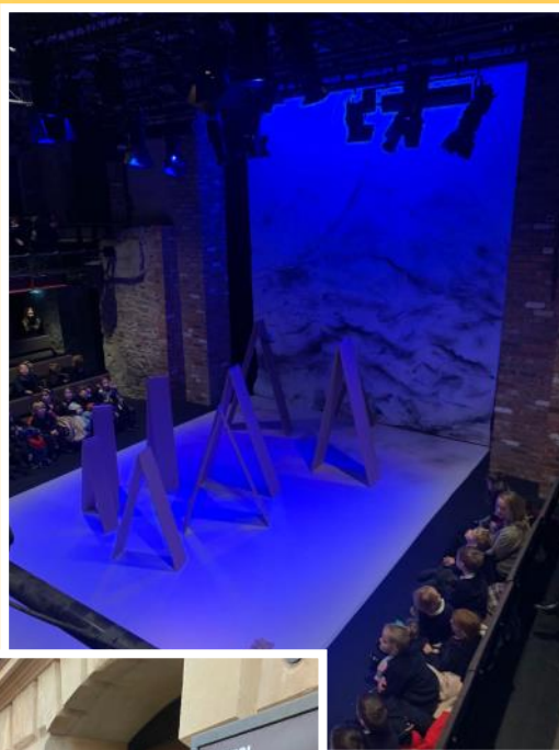
Year 3 trip to Bristol Old Vic Theatre!