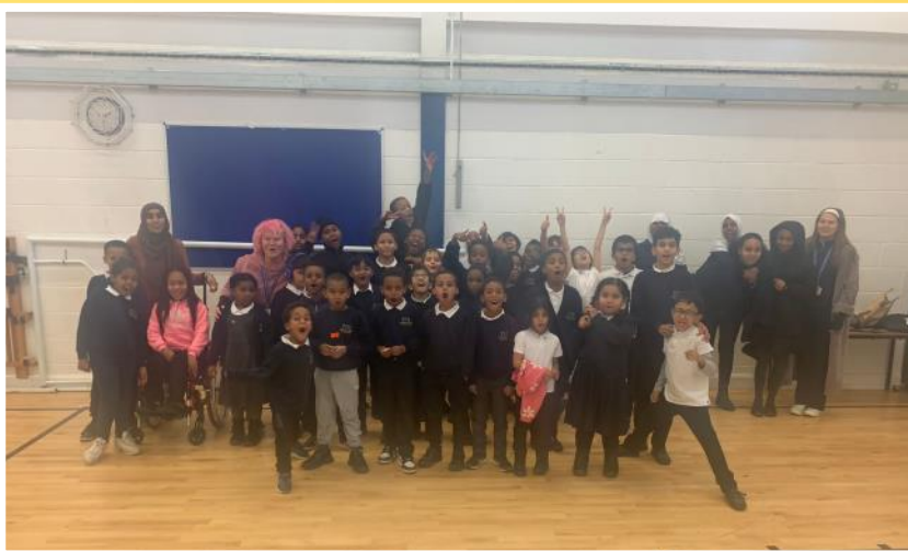
Sycamore House points party!