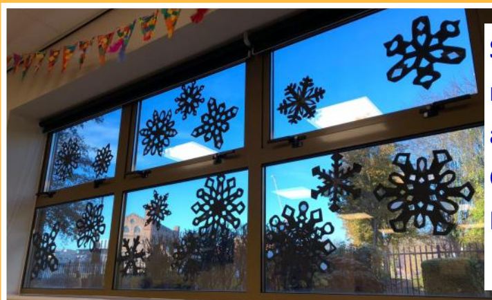
Snowflakes made at Craft and Chat with Colourful Minds!