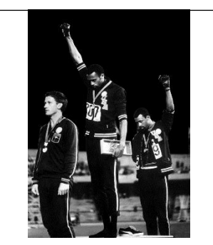
Photograph of black power salute